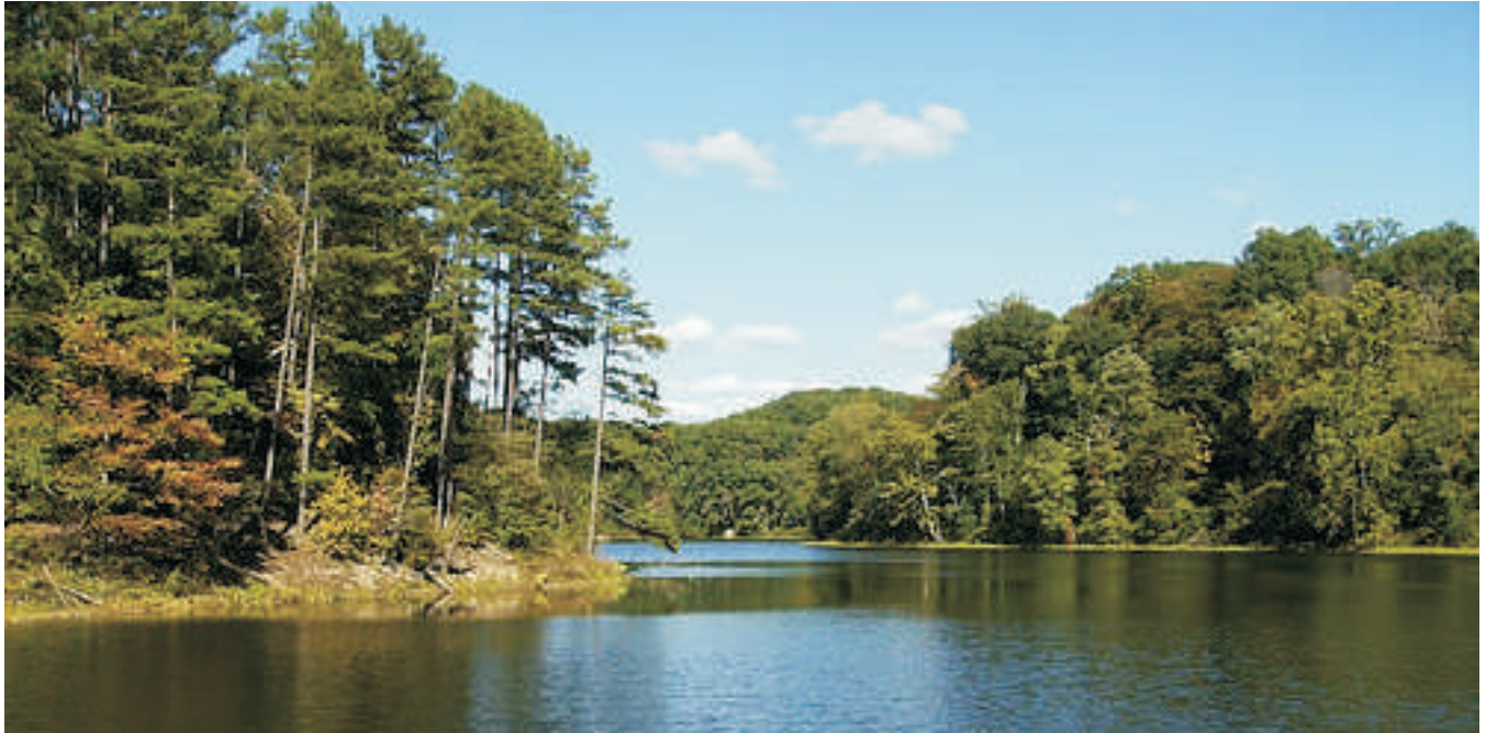
Lake Vesuvius, Lawrence County, Ironton.